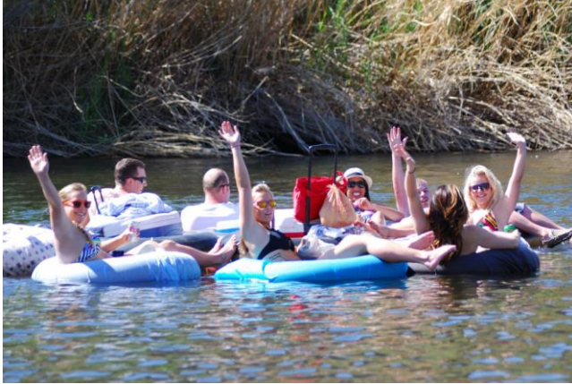
WAVE AS YOU FLOAT BY!