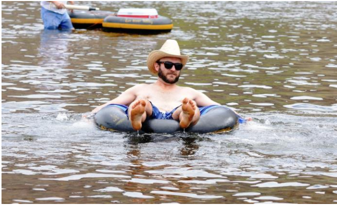
COWBOY FLOAT YEE HAW