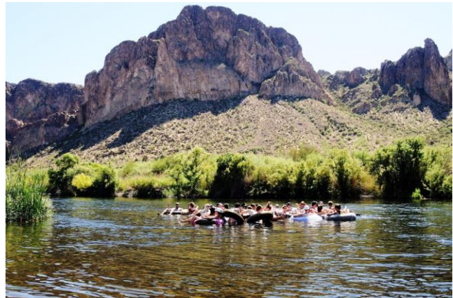
MAJESTIC MOUNTAINS - SUNSHINE ABOUNDS