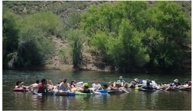
ENJOY A KICK BACK FLOAT TIME