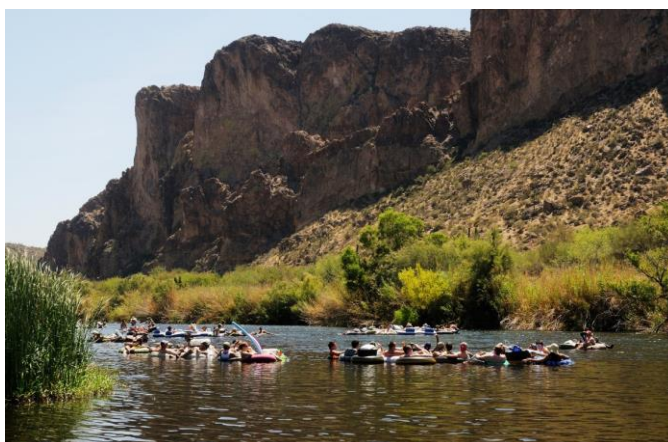
TUBING ON THE MINI-GRAND CANYON