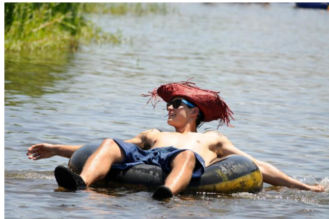
THIS IS THE LIFE! RELAX & ENJOY