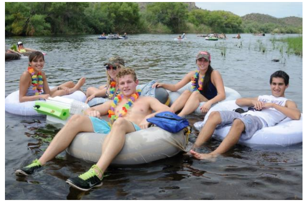
FRIEND TIME ON THE RIVER