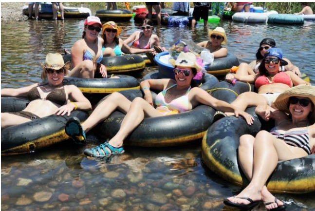
LADIES TIME ON SALT RIVER