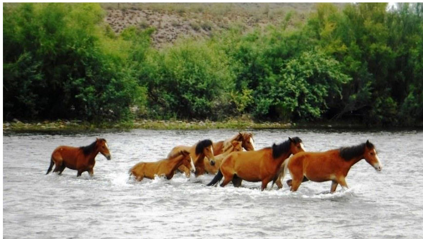
CATCH A GLIMPSE OF THE WILD HORSES CROSSING THE SALT RIVER!