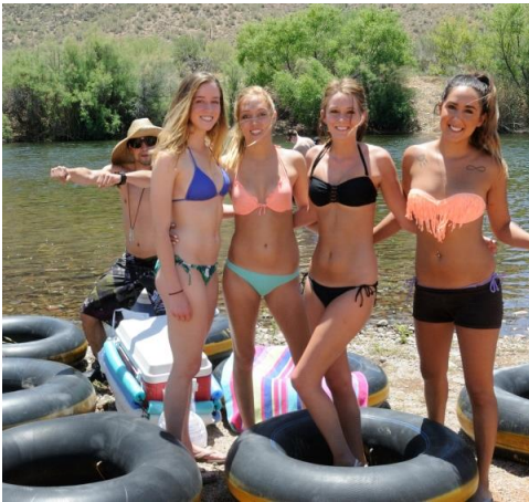
READY FOR FUN IN THE SUN