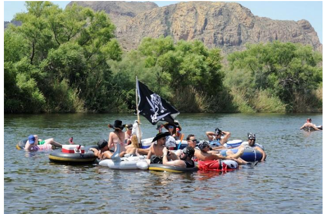
PIRATE SIGHTINGS ON THE SALT RIVER!