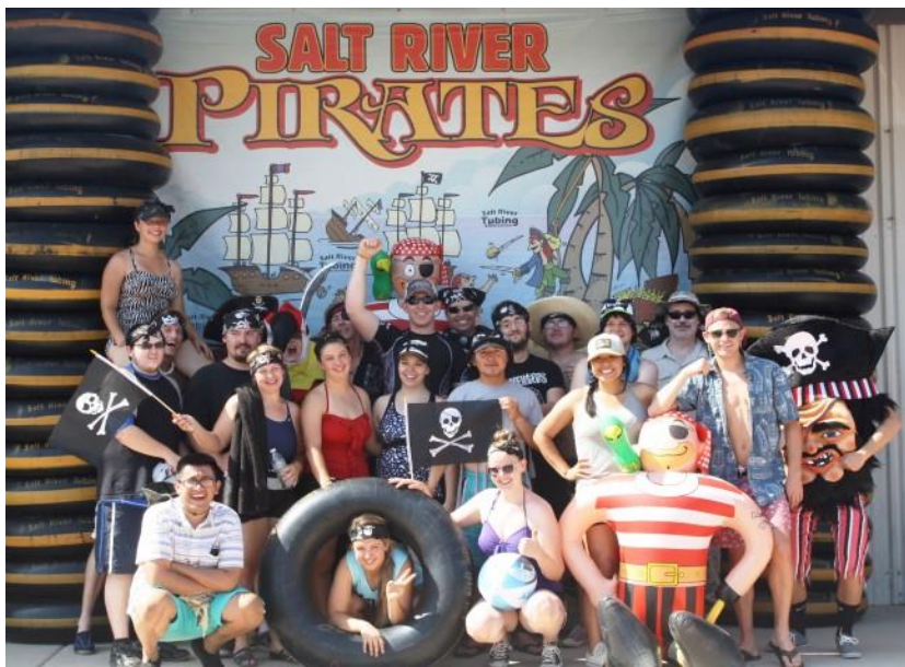
AHOY YE BUCCANEERS!