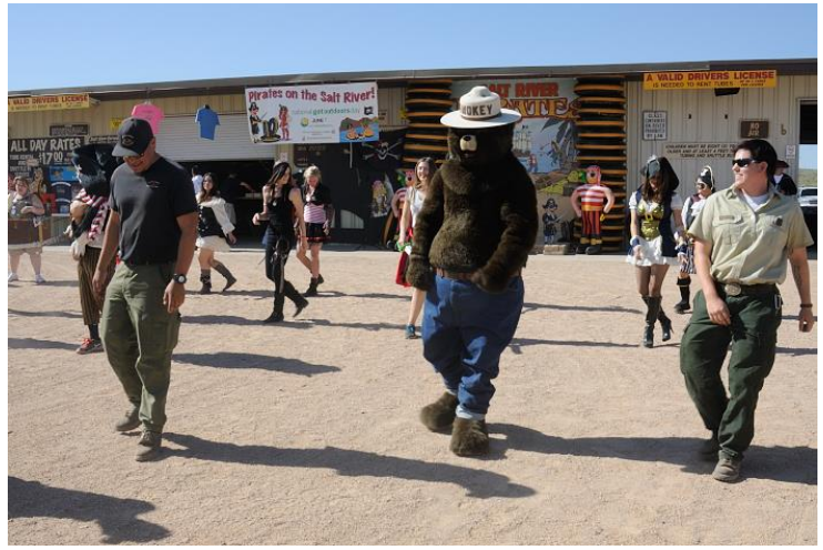
EVERYONE LOVES SMOKEY! ARRR!