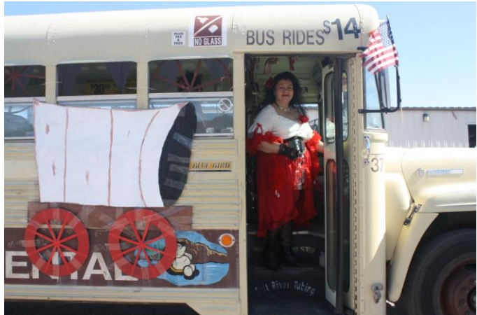
HOP ABOARD A CHUCKWAGON RIVER BOUND