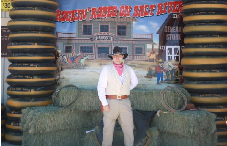
NEW SHERIFF IN TOWN