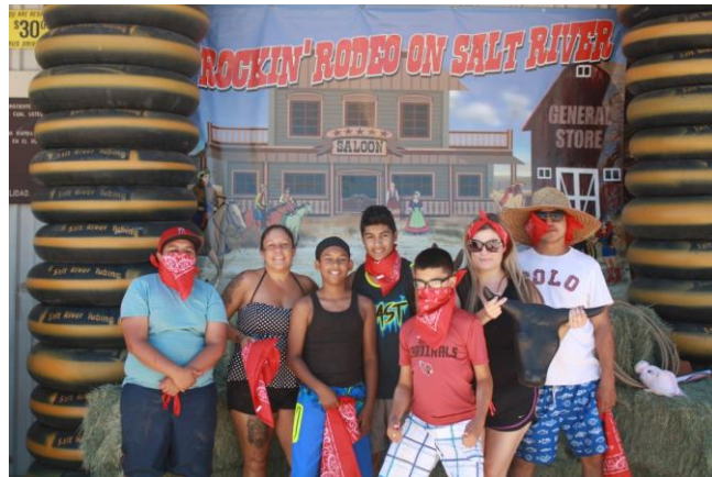
WHO ARE THOSE MASKED BANDITS?