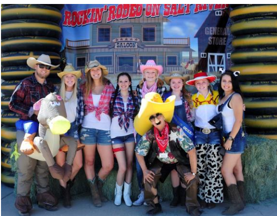
COWGIRLS & FRIENDS