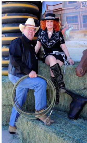
YA'LL COME BACK!