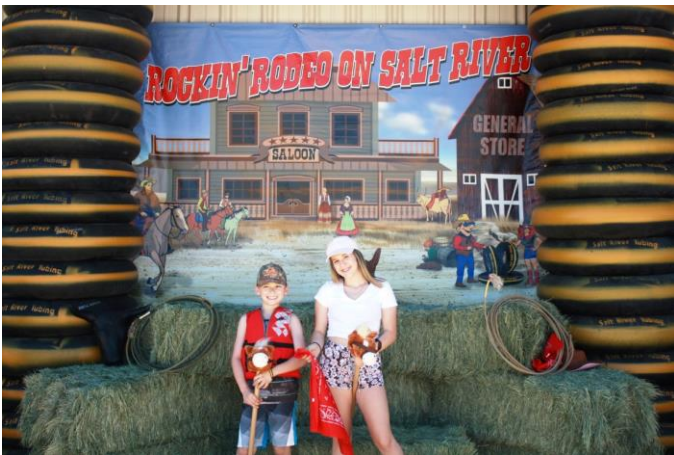
PONY RACERS FINALISTS