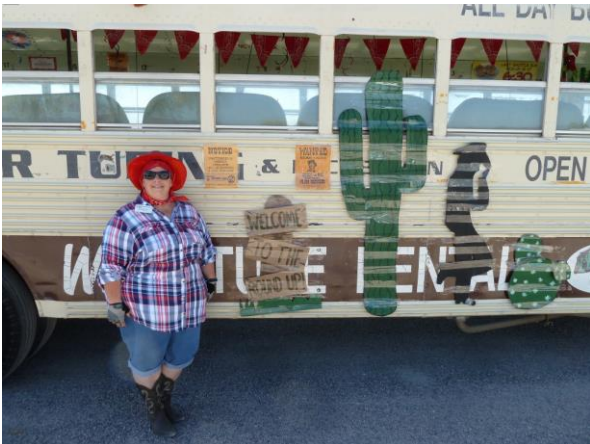
CHUCKWAGON READY TO ROLL