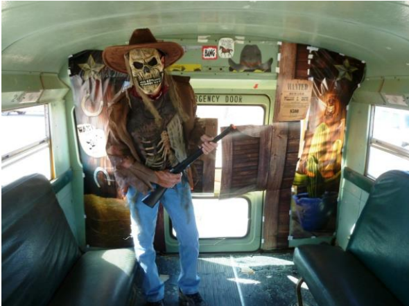
SCARY COWBOY CHUCKWAGON DRIVER!