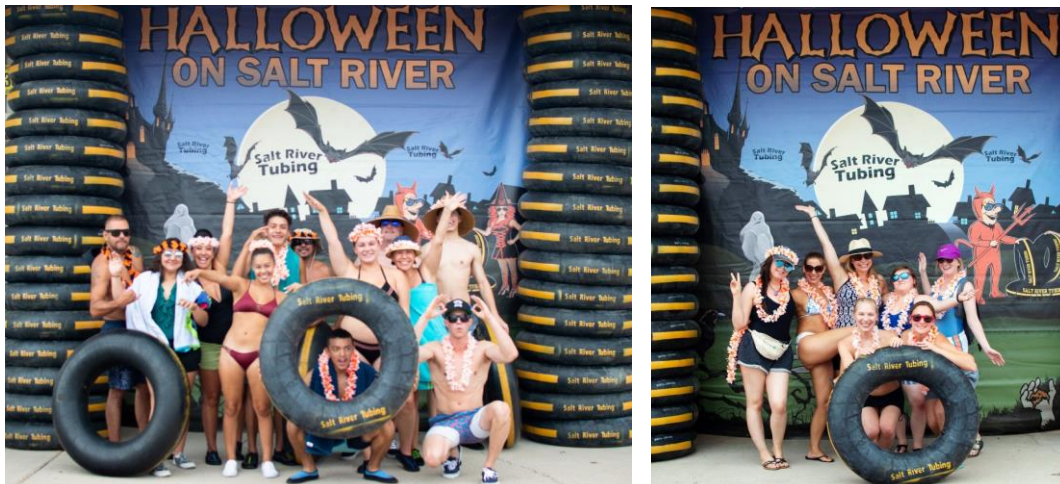
SPOOKSTERS & TRICKSTERS ON SALT RIVER!

2019-Permission to reprint, publish and televise photographs is granted by Salt River Tubing & Recreation, Inc. Photo release forms have been obtained and are on file. Higher resolution photos are available upon request.