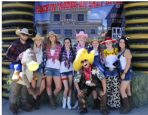
COWGIRLS & FRIENDS