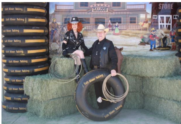
YA'LL COME BACK!