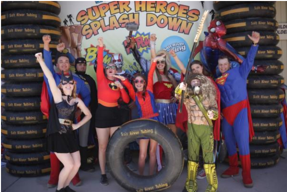
JUMP FOR THE HEIGHTS