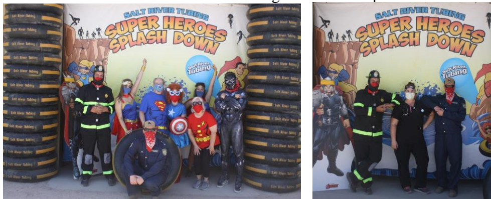
CELEBRATING REAL-LIFE SUPER HEROES!

2021-Permission to reprint, publish and televise photographs is granted by Salt River Tubing & Recreation, Inc. Photo release forms have been obtained and are on file. Higher resolution photos are available upon request.