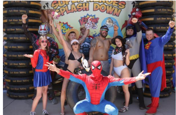
SUPERHEROES EN MASSE