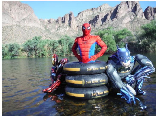
SUPERHEROES SPLASH DOWN ON SALT RIVER!

SRTR Operate under Permit of the USDA Forest Service in Tonto National Forest