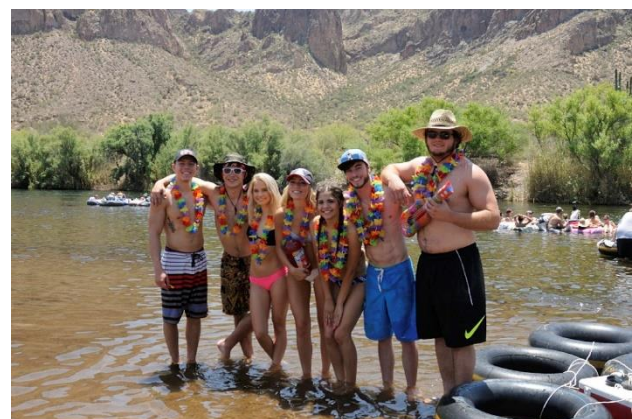
STRUMMING YOUR UKELELE!