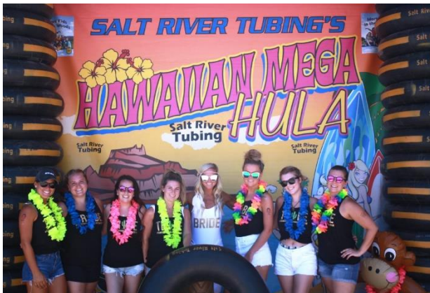
BRIDES LOVE MEGA HULA!