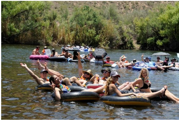
WAVE ALOHA AS YOU SAIL THE SALT RIVER!