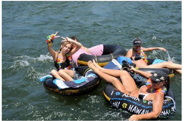
SAIL YOUR TUBE HAWAIIAN-STYLE!