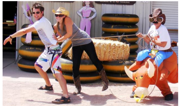
BUCKAROO FUN AT ROCKING RODEO ROUNDUP!