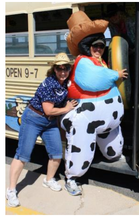
CHUCKWAGON DRIVERS ARE A HOOT!