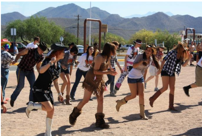
ELECTRIC SLIDE DANCERS!