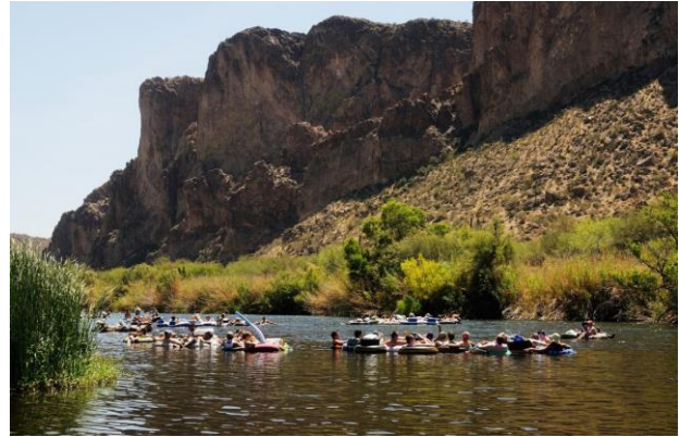
FLOATING ON THE SALT RIVER IN THE "MINI-GRAND CANYON" OF TONTO NATIONAL FOREST!